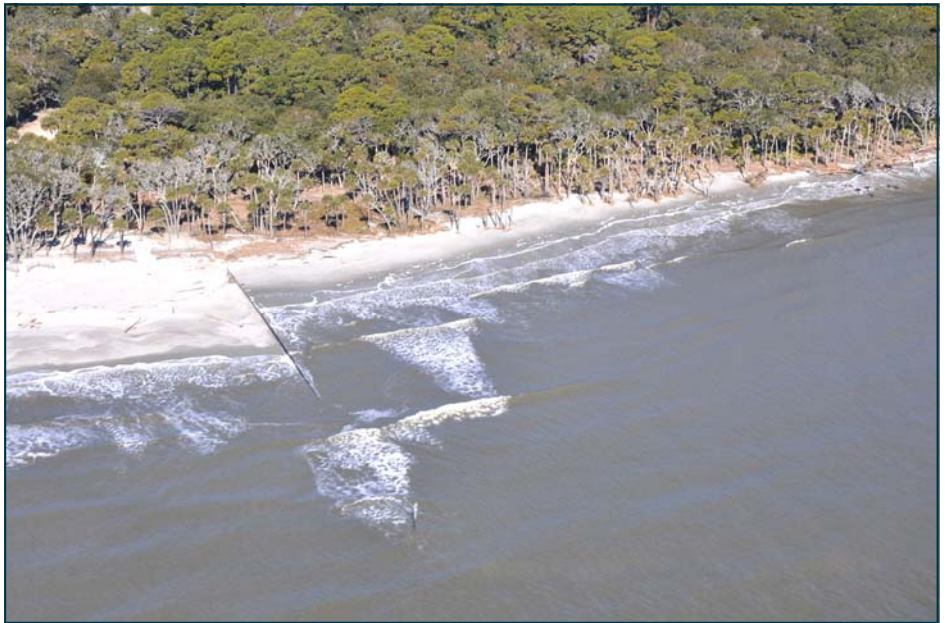
An aerial of a groin on Hunting Island shows the downdrift erosion groins cause

Baruch Foundation, which manages the North Inlet/Winyah Bay NERR has also filed an appeal and SCELP has been working together with its attorneys to challenge the agency's decision. A trial date has been set for April 17-19, 2011. SCELP is representing the S.C. Coastal Conservation League and the Sierra Club-Winyah Group in the administrative appeal.