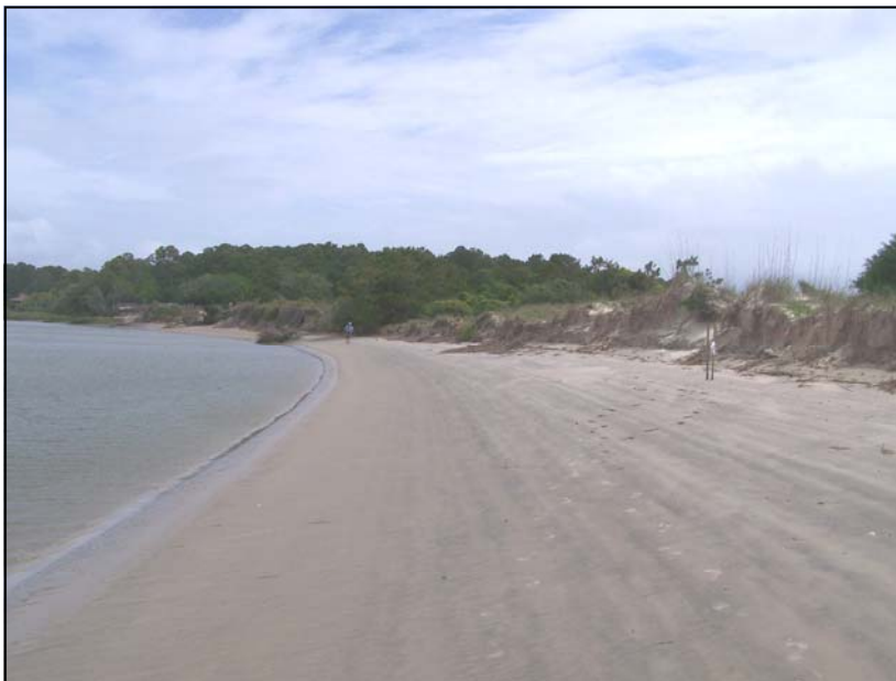
The sandy banks of the Kiawah River, which the Supreme Court ruled cannot be covered with a concrete block wall

SCELCP and DHEC appealed the ALJ's decision to the S.C. Court of Appeals. SCELCP simultaneously filed a motion to transfer the case to the Supreme Court and asking the Court to impose an order preventing construction of the bulkhead/revetment until the Court issued an opinion. The Court heard arguments on January 18, 2011 and issued its opinion on November 21, 2011. The Court's opinion is a sweeping victory for Captain Sam's Spit and for protection of our coastal resources.