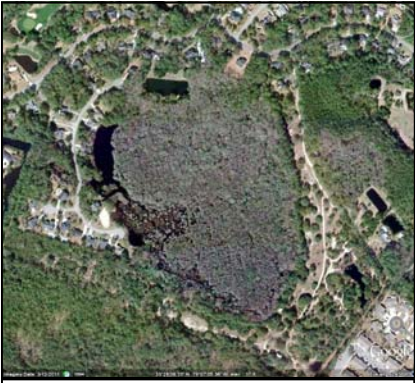
Aerial of the Carolina Bay at issue

For ten years the environmental community has fought for state-wide protections for “isolated wetlands,” wetlands that are not adjacent or connected to navigable waters. This fight was necessitated by a U.S. Supreme Court decision in 2001, which eliminated federal protection for between 300,000 – 600,000 acres of isolated wetlands in South Carolina. Since that time, the environmental community has made attempts at legislative fixes to ensure protection. SCELP has always taken the position that such wetlands are protected under our state’s Pollution Control Act, but no court had ever held as such.