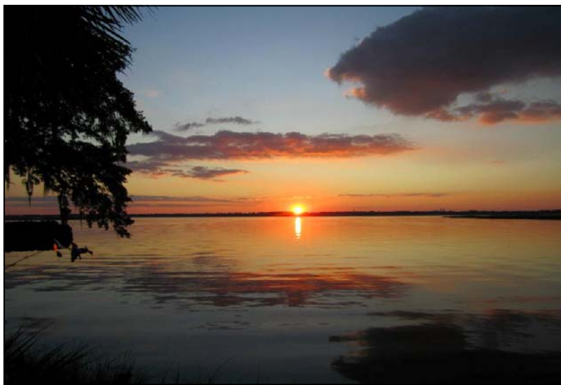
Sunset overlooking Winyah Bay at the 2011 Wild Side