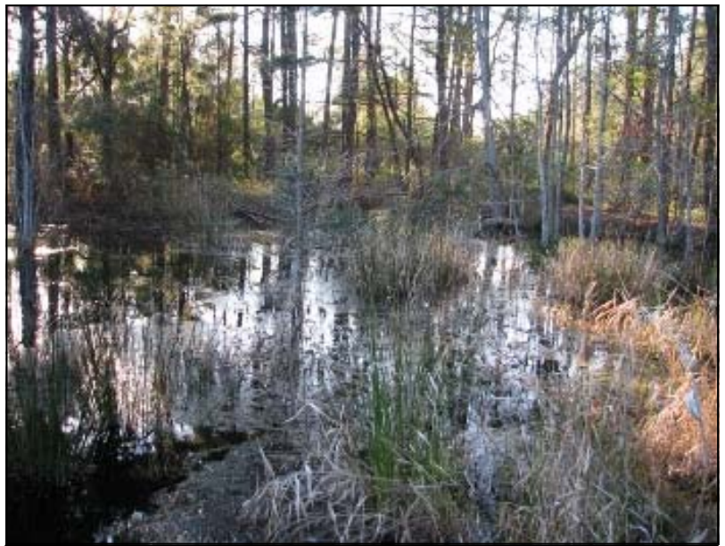
The Carolina Bay prior to being filled by Smith Land Company

On July 11, 2011, the South Carolina Supreme Court issued a landmark opinion declaring that S.C. law requires protection of isolated wetlands. The Court first noted that while the U.S. Supreme Court has held that isolated wetlands are not covered under the federal Clean Water Act, this has no impact on DHEC’s ability to regulate those wetlands. The Court found that DHEC in fact has jurisdiction to regulate isolated wetlands based on the clear language in the Pollution Control Act. Given that DHEC has jurisdiction over the isolated wetlands, the Court next held that Smith Land Company was required to get a permit from DHEC before filling the wetlands. Smith Land Company violated South Carolina law by filling isolated wetlands without a valid state permit. Finally, the Court held that the Pollution Control Act provides a private right of action. In other words, private citizens and groups can sue to enforce the provisions of the Act.